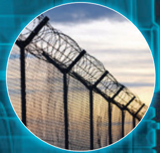
High Security Facilities (Strategic/Government/Military)