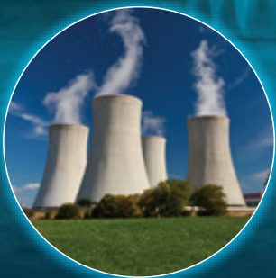
Energy Plants & Facilities